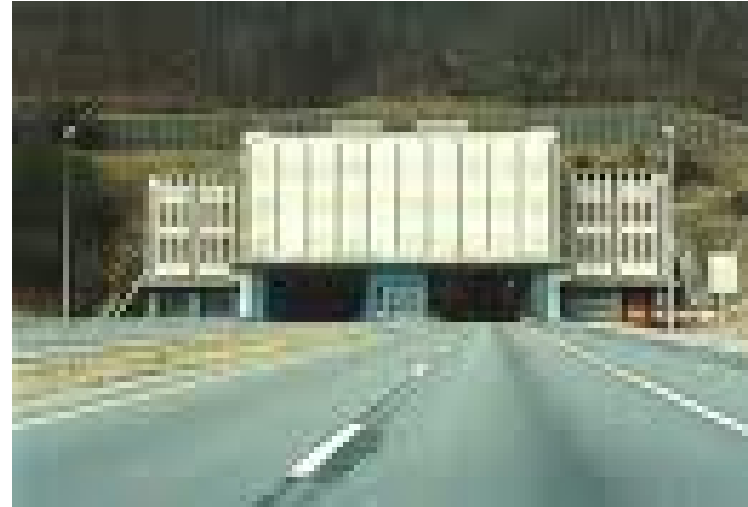
Big Walker Mountain Tunnel