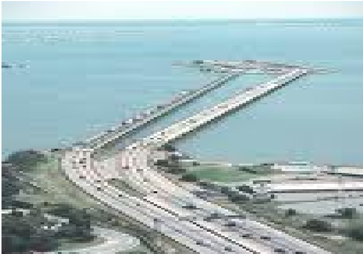
Hampton Roads Bridge Tunnel