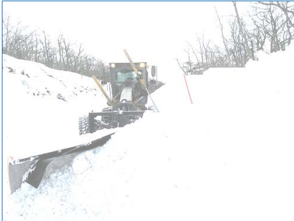
Bath County Route 703