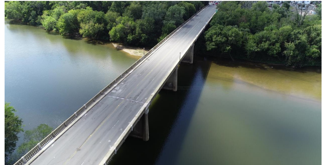
The Chatham Bridge was built in 1941, and is structurally deficient; It carries an average of 16,000 vehicles a day