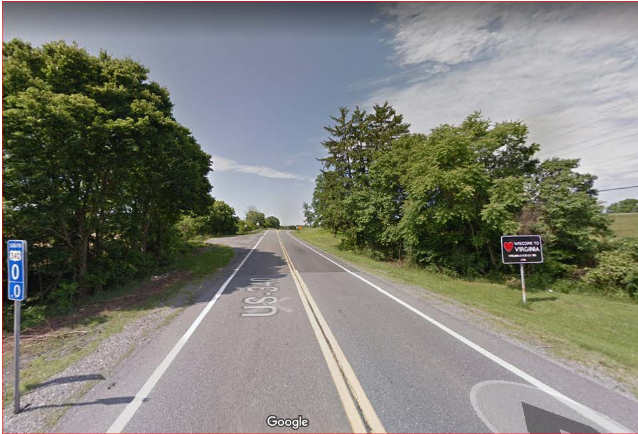
Route 340, looking South from W. Virginia Line