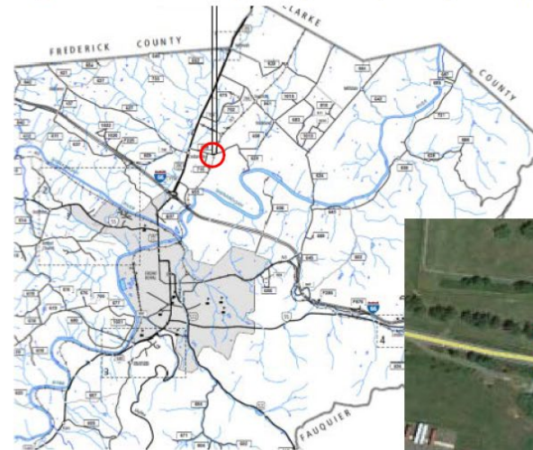
PROJECT LOCATION MAP WARREN COUNTY, VIRGINIA Project 0658-093-R13, B632, M501, P101, R201 (UPC 112945)