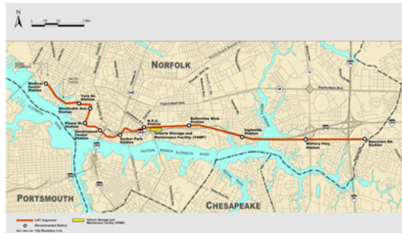
The Tide Route